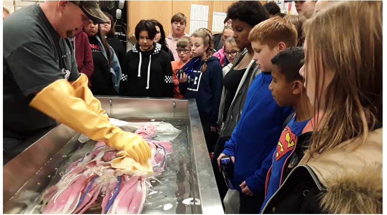
MIDDLE AND HIGH SCHOOL STUDENTS LEARNING ABOUT PENN STATE FAYETTE'S SYNTHETIC CADAVER.

As we watch the trends across the country, we recognize how fortunate we are to have a strong Christian school as part of our ministry. God has gifted us all differently, and we celebrate our uniqueness through our identity in Christ by using those gifts when walking the path of our God-given purpose. Giving our Champion Christian School students opportunities to discover those gifts and talents to develop a sense of their purpose is central to the education at CCS. This year, our directed study students have experienced first-hand the trades of computer technology, auto mechanics, child-care, teaching, and welding. Our health